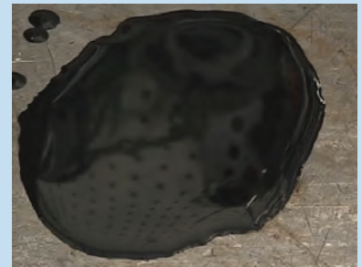
Transmission fluid should appear reddish and opaque like the fluid on the top. If ATF appears brown like the fluid on the bottom, it is past time to change it.