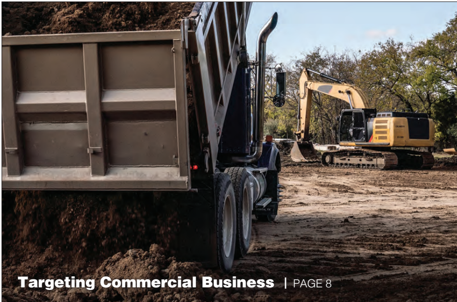
Targeting Commercial Business | PAGE 8